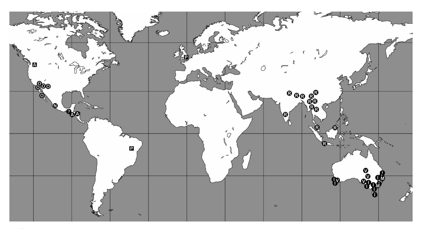
FIGURE 1. Distribution of extant and fossil Ithonidae. Circles indicate extant genera: A, Adamsiana ; O, Oliarces ; N, Narodona ; ?, unknown genus; R, Rapisma ; I, Ithone ; V, Varnia ; M, Megalithone ; squares indicate fossil genera: A, Allorapisma (Early Eocene); P, Principiala (Early Cretaceous).

Institutional abbreviations: SRIC, Stonerose Interpretive Center, Republic, Washington (U.S.A.).