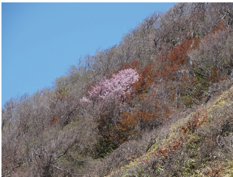
Fig. 9. Deciduous forest near the collection site with leafy Betula ermanii , flowering Prunus sargentii and Quercus crispula retaining last year's brown leaves yet. (Photo by S. A. Rybalkin, 20 May 2021).

Five species were most numerous: Pseuderannis lomozenia (82 collected ex.), Trichopteryx hemana (65 ex.), Lycia hirtaria (60 ex.), Xerodes rufescentaria (46 ex.) and Paradarisa consonaria (43 ex.), which usually also common on the continental Far Eastern same latitude territories.