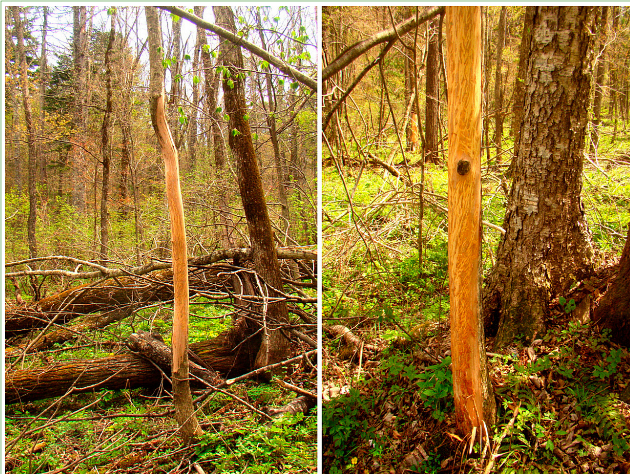
Fig. 3. Bark damage in young Ulmus laciniata after bark stripping by Cervus elaphus xanthopygus. Sample plot. 3.05.2021.

Рис. 3. Характер повреждений коры у молодых ильмов лопастных после кормежки изюбрей. Пробная площадь. 3 мая 2021 г. Фото авторов