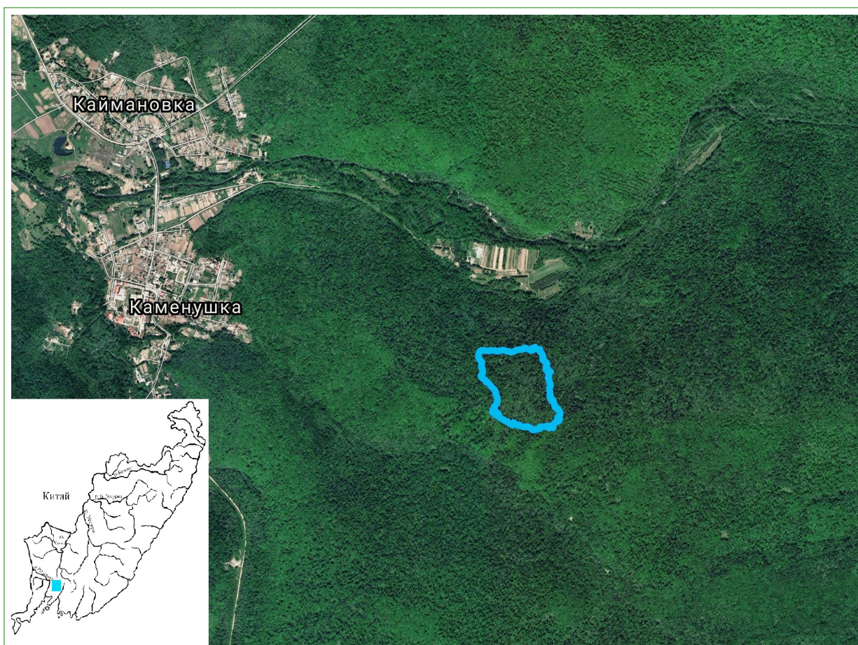
Fig. 1. Location of the sample plot. Surroundings of the village of Kamenushka, Ussuriysk urban district, Primorsky Region. The inset shows the research area

Рис. 1. Расположение пробной площади. Окрестности с. Каменушка, Уссурийский городской округ, Приморский край. На врезке показан район исследований