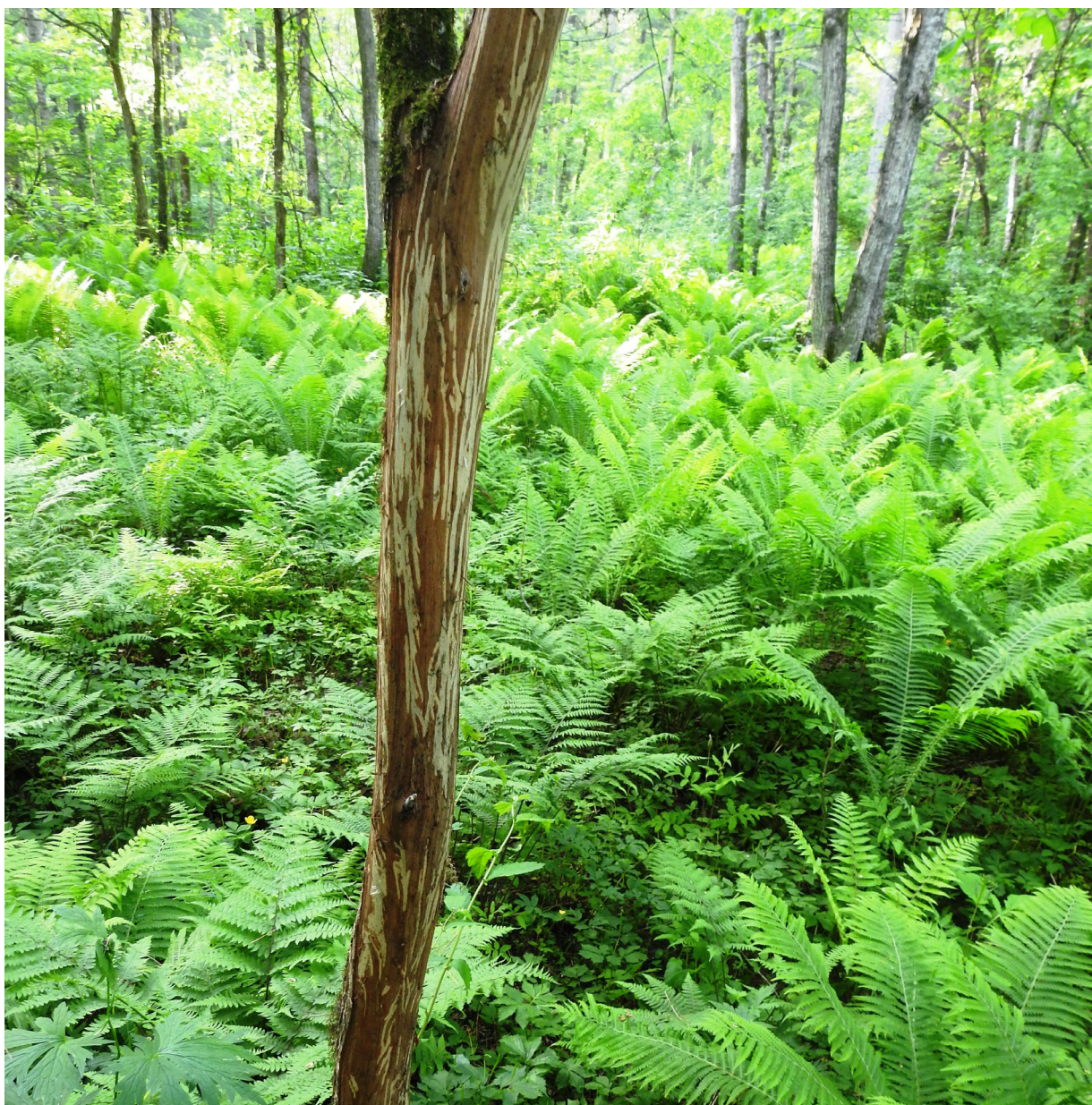
Fig. 5. Young Ulmus laciniata debarked by Cervus elaphus xanthopygos. “The Udege Legend” National Park. Krasnoarmeysky district. 2.06.2021.

Рис. 5. Молодой ильм лопастной с объединенной изюбром корой. Национальный парк «Удэгейская легенда». Красноармейский район. 2 июня 2021 г.