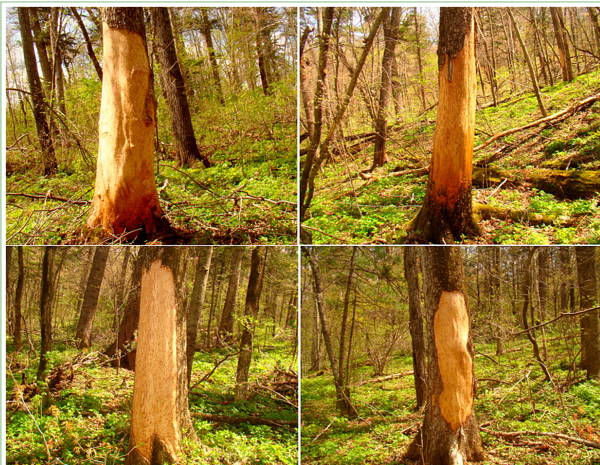
Fig. 2. Bark damage in large Ulmus laciniata after bark stripping by Cervus elaphus xanthopygus. Sample plot. 3.05.2021.

Рис. 2. Характер повреждений коры у крупных ильмов лопастных после кормежки изюбрей. Пробная площадь. 3 мая 2021 г. Фото авторов