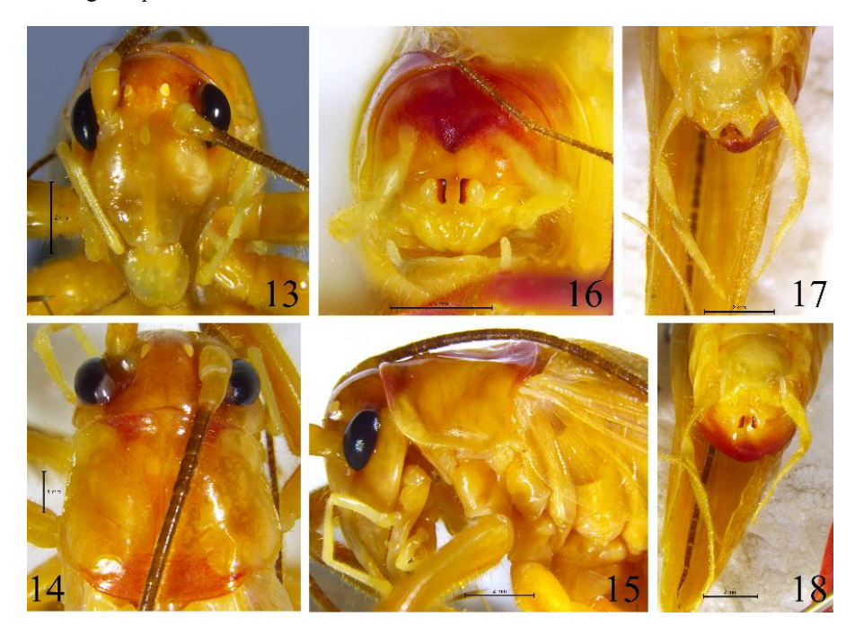
Figs. 13–18. Dialarnaca quadrateprocera sp. n., male. 13 – head, frontal view; 14–15 – head and pronotum (14 – dorsal view; 15 – lateral view); 16–18 – apex of abdomen (16 – apical view; 17 – ventral view; 18 – ventro-apical view).

ETYMOLOGY. The new name derives from male 10th abdominal tergite with rectangular processes.