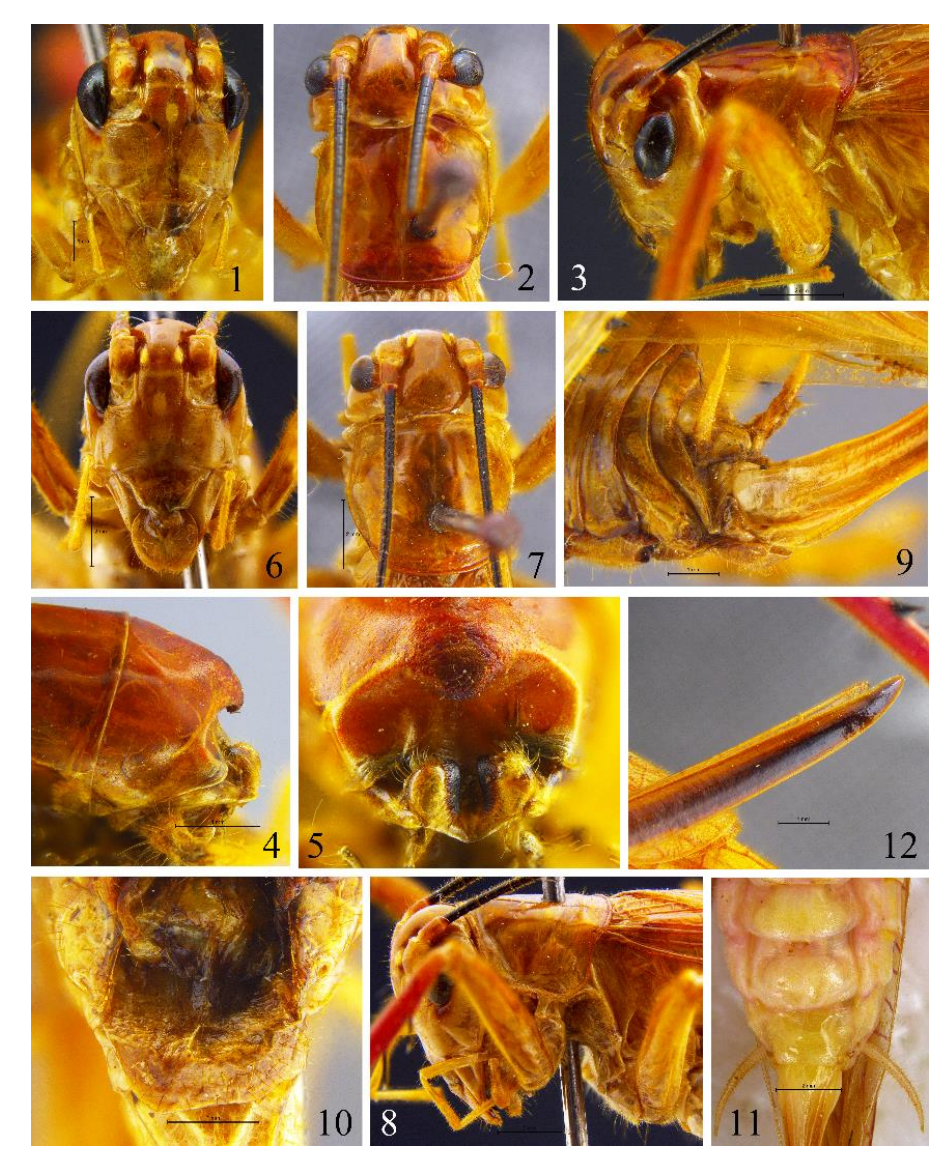
Figs. 1–12. Dialarnaca quadrateprocera sp. n., male (1–5) and female (6–12). 1, 6 – head, frontal view; 2–3, 7–8 – head and pronotum (2, 7 – dorsal view; 3, 8 – lateral view); 4–5, 9 – apex of abdomen (4, 9 – lateral view; 5 – apical view); 10–11 – subgenital plate, ventral view; 12. apex of ovipositor, lateral view.