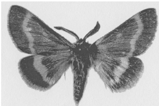
Fig. 1. Lemonia dumi , male.

The family Lemoniidae consists of one genus Lemonia Hbn., including about ten locally spreading species, distributed mainly within Mediterranean (South Europe, North Africa and Asia minor). Only two species are characterised by rather waste areas: Lemonia taraxaci Esp., occurring from Middle Europe up to Western Siberia and L. dumi L., so far known to be spreading from Western Europe up to Ural Mountains [1, 2]. In fact the latter occurs also in the South of Western Siberia (upon material from the collection of Institute of Animal Systematics and Ecology, Novosibirsk, personal communication by V.V. Dubatolov), and in East Siberia (upon material of 3♂, 1♀, labelled: "Irkutsk, 8-18.IX 1916, Rodionof leg.", deposited in the collection of Zoological Institute, Russian Academy of Sciences, St-Petersburg). However it was considered till now this family is not represented in the Asian part of Russia, especially in the Far East. In September 1997 one specimen of L. dumi was found in the vicinities of Blagoveshchensk, Middle Amur region. So this is the most eastern founding of L. dumi in Eurasia and the first record of Lemoniidae species from the Russian Far East.