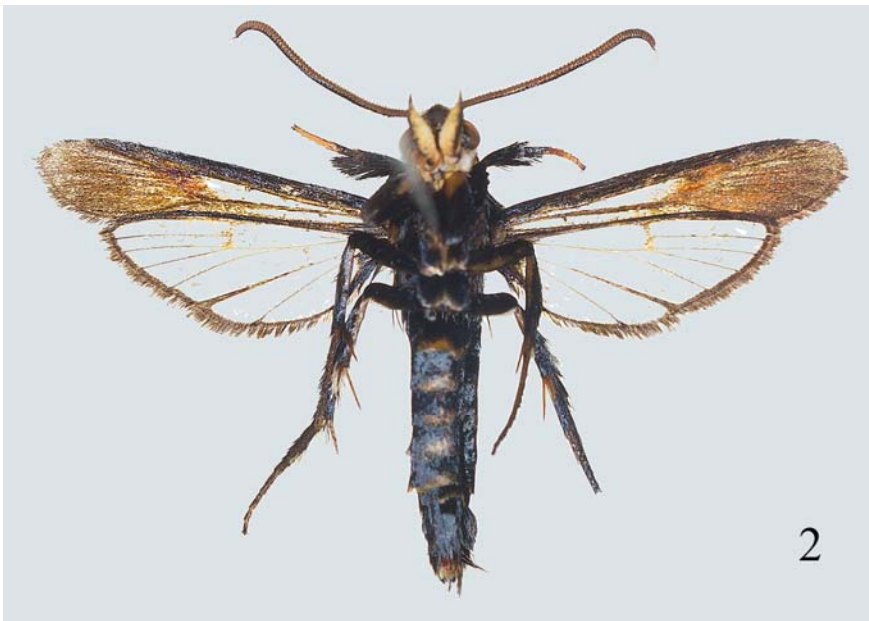
Figs 1–2. N. sulawesiensis sp. n.: 1 – holotype ♂ (Sesiidae pictures No 0231–0232–2014), alar expanse 27.8 mm; 2 – ditto, underside.