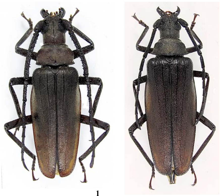
Figs. 1, 2. Aegosoma ivanovi sp. n. 1 – ♂, holotype; 2 – ♀, paratype from Primorskii krai (Merkushevka).

than body length, in females – surpassing elytral middle; relative length of antennal joint about the same as in Ae. sinicum ; sculpture of antennal surface in males much rougher than in Ae. sinicum (Figs 9 vs 11), joint 1 with rough irregular rugae, joints 3 and 4 with distinct transverse carinae and long internal spines; in females joint 1 with dense regular punctation (rugosely punctate in Ae. sinicum (Figs 10 vs 12), joints 3-5 sparsely punctate, shiny (densely irregularly punctate, dull in Ae. sinicum ). Prothorax strongly transverse, strongly widened posteriorly, usually much wider than in Ae. sinicum (in some specimens less wider than in Ae. sinicum ), in males from 1.7 to about 2.3 times shorter than basal width; in females from 2.2 to about 2.5 times shorter than basal width; lateral roughly sculptured pronotal area in male and in female much wider than in Ae. sinicum ; orange setal pronotal areas (typical for Ae. sinicum ) indistinct. Elytra with very fine indistinct pubescence, distinctly shiny, with small shining areas among fine punctation (absent in Ae. sinicum ), shiny