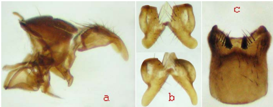
Fig. 2. Linnophora ponti sp. n.: a – male terminalia, lateral view, b – cercal plate dorsally (from two slightly different angles of view), c – sternite 5.

with 3 p on one leg each) and with apical ad (short), pd (medium), av and pv (long). f3 with 4-5 long av in apical 2/5, complete row of ad and 1 pd preapical. t3 chaetotaxy rather variable, 1(2) strong submedian ad , 1-2 weak submedian setae in a -position, 6-9 long av on median 1/3 to apical 1/2, these av setae usually organized in 3-4 pairs with first seta in more a and second seta in more v positions, but in some specimens placed in a “normal” row of av setae, d preapical and av apical setae strong, ad apical shorter than tibial width. Tarsi unmodified.