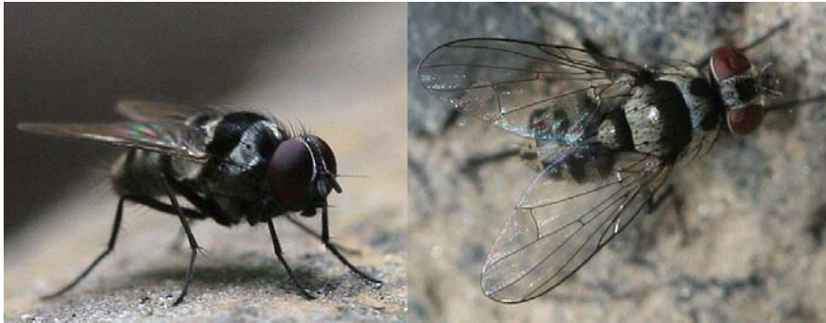
Fig.1. Linnophora ponti sp. n., male and female.