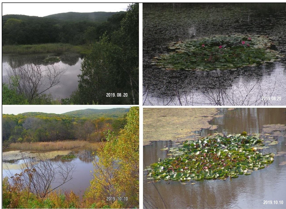
Figure 2.2. The development of a new Komarov lotus population in August - October 2019