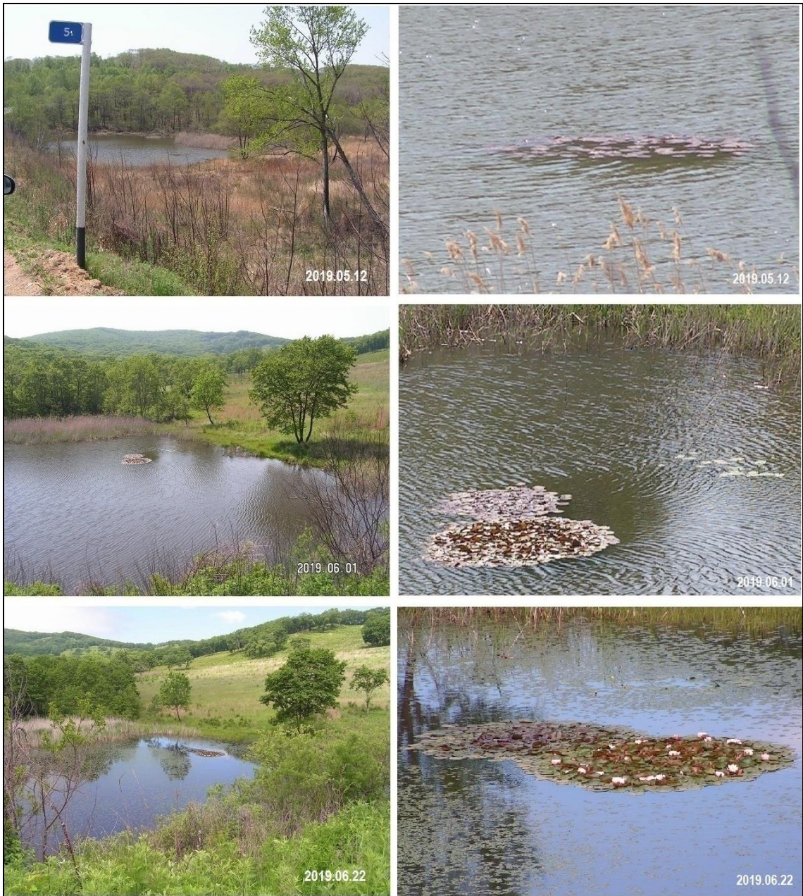
Figure 2.1. The development of a new Komarov lotus population in May - July 2019.