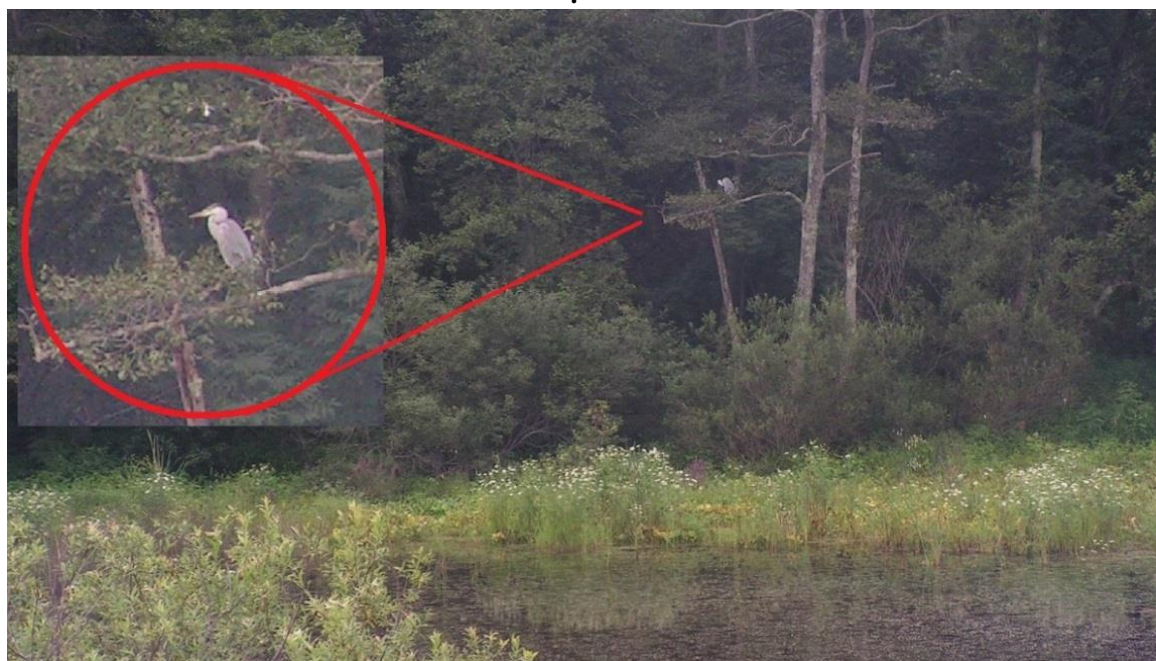
Figure 3. Gray heron on a tree near the Fifth Kilometer lake.