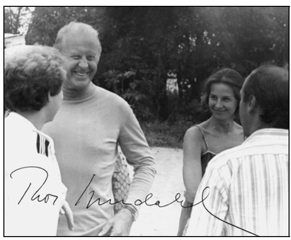
Fig. 3. Thor Heyerdahl talks with the staff of the MBS "Vostok" in 1981. His autograph is in the bottom of the photograph.

The biological station was visited also by other world celebrities, such as Thor Heyerdahl, who was a renowned traveler, anthropologist, an investigator in peoples' migrations, and a writer (Fig. 3).