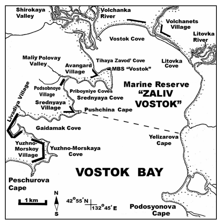
Fig. 2. Vostok Bay and the Marine Reserve "Zaliv Vostok". Dashed line – southern boundary of the Reserve.

- the first Marine Reserve in the USSR and Russia (Category 6 IUCN: Protected area with sustainable use of natural resources; protected area managed mainly for the sustainable use of natural ecosystems [2]) was created in 1989 under the initiative of the Institute of Marine Biology (IMB) of the Far Eastern Branch of the Russian Academy of Sciences (FEB RAS).