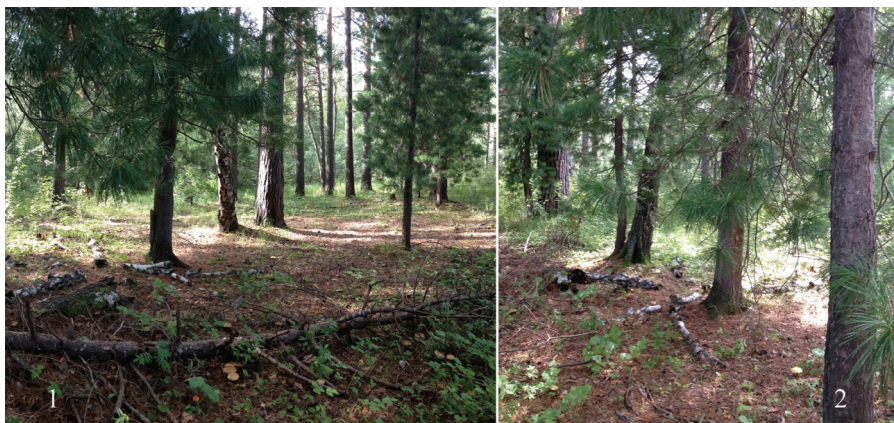
Figs 1, 2. Gathering place (Russia, Western Siberia, Tyumen Region, Tobolsk District, nearly Nadtsy Settlement, mixed forest) of Epidamaeus hexatuberculatus sp. n.

During taxonomic identification of Epidamaeus from the Russian Western Siberia, we found one new species. The main goal of this paper is to describe and illustrate this species.