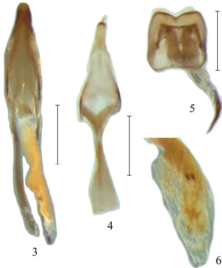
Figs. 3–6. Caenorhinus (Flavodeporaus) belokobylskii sp. n., genitalia, dorsal view: 3 – aedeagus; 4 – tegmen; 5 – tergite 8; 6 – armament of endophallus. Scale bar 1.0 mm for figs 3–5.

Antennomere 10 1.5 times as long as wide, 1.2 times as wide as antennomere 9. Antennomere 11 2.0 times as long as wide, 1.1 times as long as and 0.8 times as narrow as antennomere 10. Pronotum campanulate, 1.6–1.7 times as long as wide at apex, 1.1 times as long as wide in middle and subequal to wide at base. Disk weakly convex, densely punctate. Scutellum trapezoid, finely punctate. Elytra 1.5 times as long as wide at base, 1.3–1.5 times as long as wide at middle, 1.5–1.6 times as long as wide at apical fourth, 2.2–2.3 times as long as pronotum, without metallic lustre. Humeri slightly flattened. Elytral striae distinct. Scutellar striole absent. Stria 9 full, merging with stria 10 near metacoxa. Interstriae convex, 4.0–5.0 times as wide as elytral stria, finely punctate. Prosternum finely punctate. Pre- and postcoxal portions of prosternum short. Procoxal cavities contiguous. Metanepisternum 3.2 times as