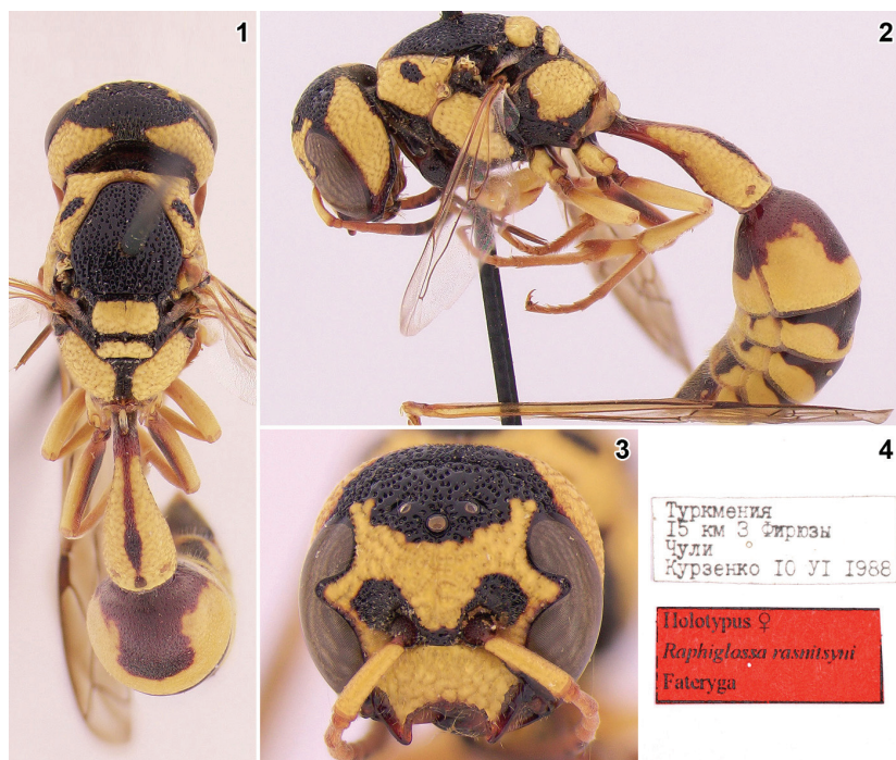
Figs 1–4. Raphiglossa rasnitsyni Fateryga, sp. n. , ♀, holotype: 1 – habitus, dorsal view; 2 – habitus, lateral view; 3 – head, frontal view; 4 – labels.

Setation weakly developed. Mandible with few strait pale setae as long as maximal diameter of flagellum. Posterior margins of T6, S4, and S5, as well as entire S6 with pale setae as long as diameter of F1 at base.