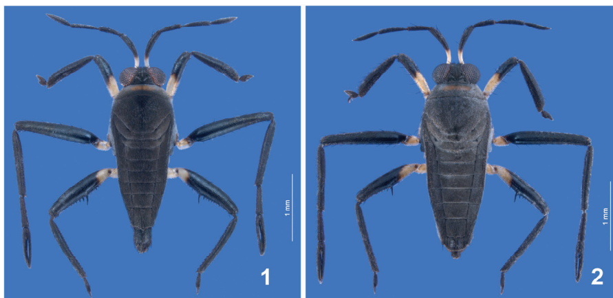
Figs 1, 2. Rhagovelia freitagii sp. n. 1 – habitus of male (paratype); 2 – the same, female (paratype).

Measurements of paratypes (n = 3). Body length 2.72–2.75; maximum body width (at metapleura) 0.95–1.02. Head width 0.69–0.72. Pronotum length 0.20–0.22, width 0.81. Mesonotum length 0.56–0.58. Metafemur width 0.24–0.26.