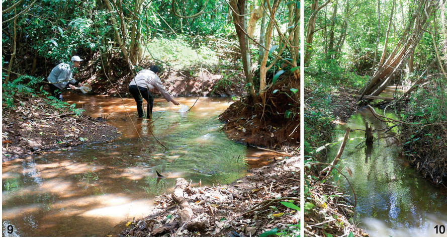
Figs 9–10. Habitats of Rhagovelia freitagii sp. n. at the type locality.

times pronotum length), strongly infuscated mesocoxae, and – most of all – by some thick short setae at the mesofemoral base in males (Zettel, 2000). Four species of Rhagovelia are known from Laos and Vietnam. A key to the species of the R. sarawakensis group from these three countries is presented below.