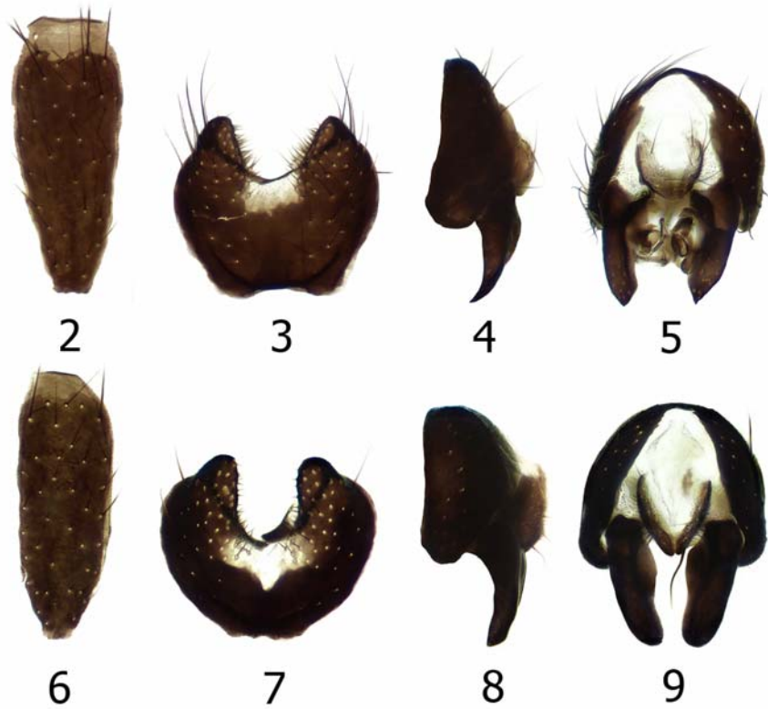
Figs 2-9. Parallelomma melanothorax sp. n., male paratype (2-5) and P. chinensis sp. n., holotype (6-9): 2, 6 – sternite 4; 3, 7 – sternite 5; 4, 8 – epandrium and surstyli, lateral view; 5, 9 – same, dorsal view.