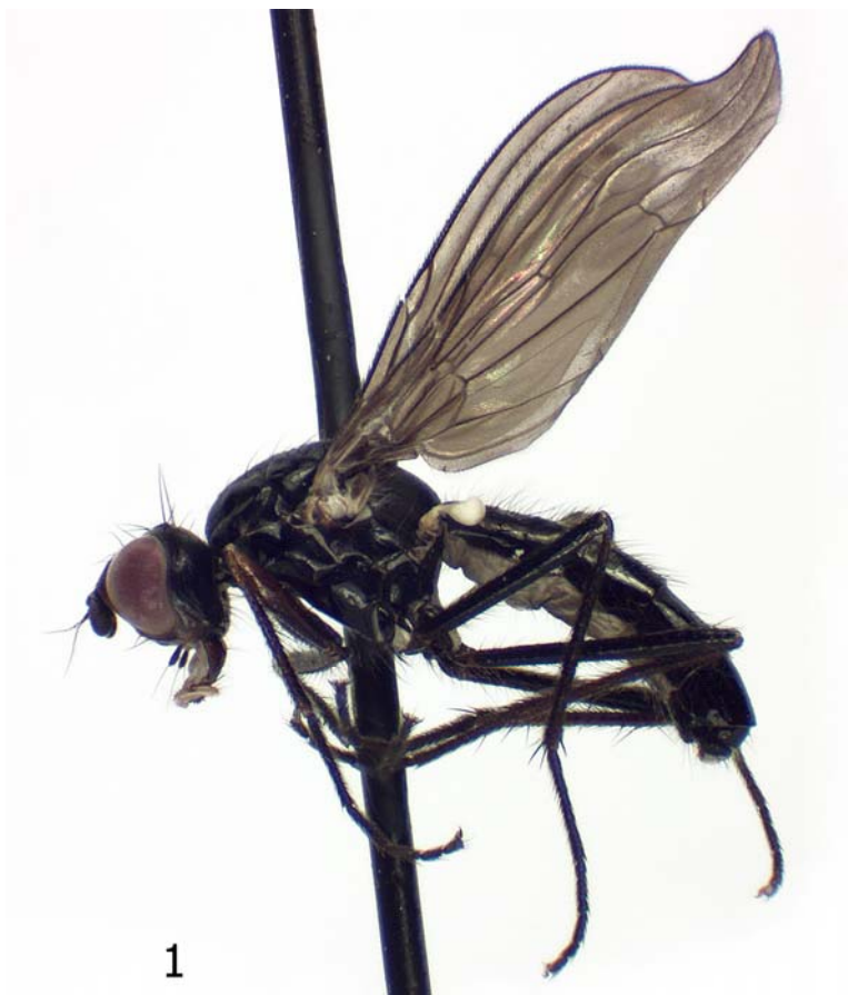
Fig. 1. Parallelomma melanothorax sp. n., adult, holotype.

Wing blackish; veins black. Upper calypter darkened, with dark margin. Lower calypter and haltere whitish.