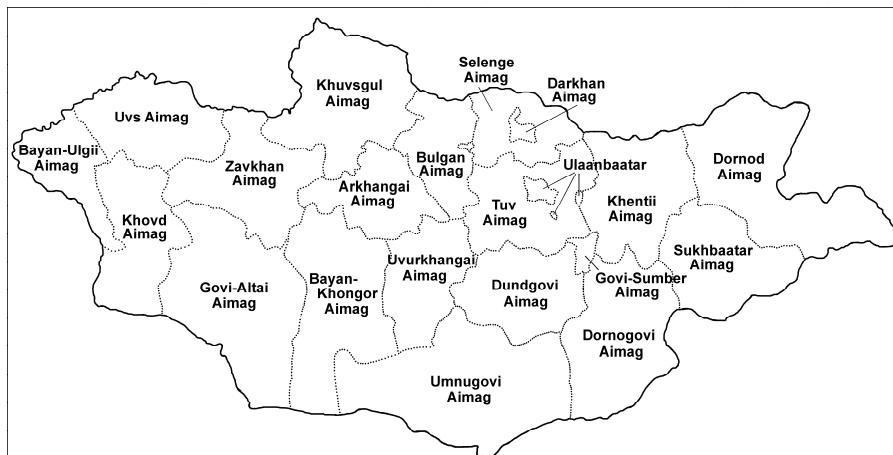
Fig. 1. Administrative map of Mongolia showing provinces (aimags) (from Kuhlmann & Proshchalykin, 2013a).

Mongolia is located in central Asia, bordered by Russia to the north and China in the south. It is the sixth largest country in Asia, covering 1,564,100 sq. km and is divided into 21 provinces called “aimags” (Fig. 1).