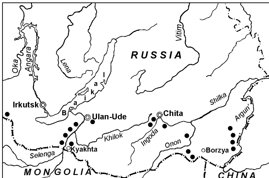
Fig. 1. The collecting places of the bees in Transbaikalia.

DISTRIBUTION. Russia: Zabaikalskii krai; Irkutskaya oblast, Khabarovskii krai, Amurskaya oblast, Primorskii krai, Sakhalin, Kuril Islands (Kunashir, Iturup), European part. – Japan (Hokkaido, Honshu), Mongolia, Europe.