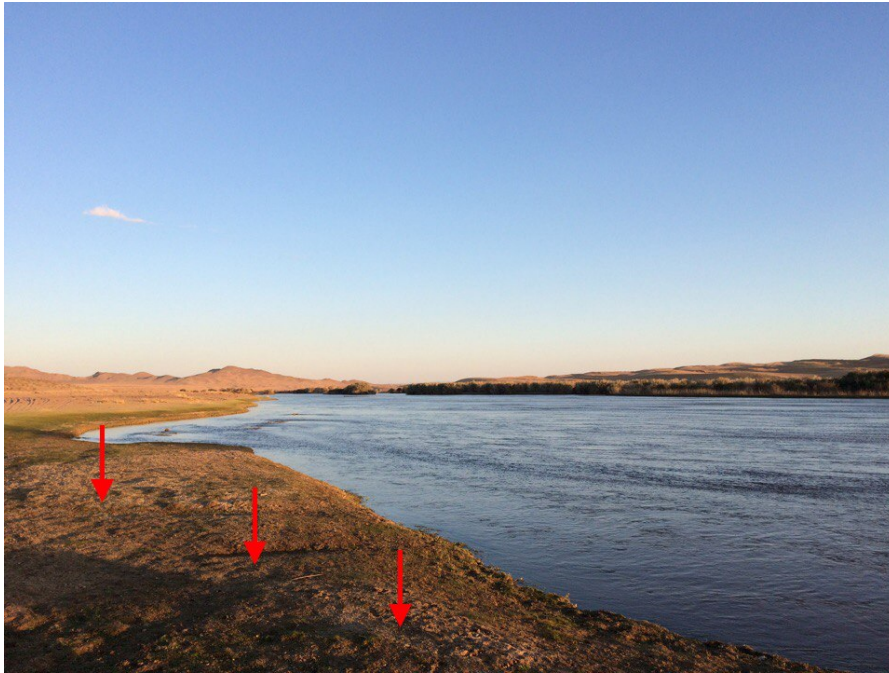
Fig. 2. Habitat of Georissus crenulatus in Mongolia, coast of Dzabkhan River.