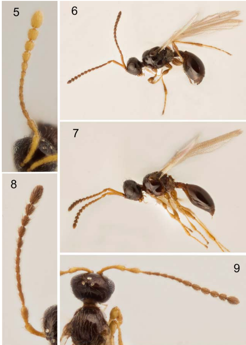
Figs 5–9. Morphological characters and variations of Entomacis species. (♀). 5, 8, 9 – E. kasparyani , antennae, dorsal views; body, lateral view: 6 – E. perplexa ; 7 – E. curticerca .

1992, 5 ♀, 1 ♂, K. Yamagishi; Kyushu, Fukuoka, Mt. Niko, 700 m, 9–10.V.1989, 2 ♀, M. Sharkey; Honshu, Iwate, Iwaizumi, Hitsutori, 770m, 11–17.VIII.1991, 3 ♀, A. Smetana; Iwate, Mt. Hayachine, 500 m, 21.VI.1989, 2 ♀, M. Sharkey; Ibaraki Prefecture, Mt. Tsukuba, 800 m, 14–25.VII.1989, 1 ♂, M. Sharkey.