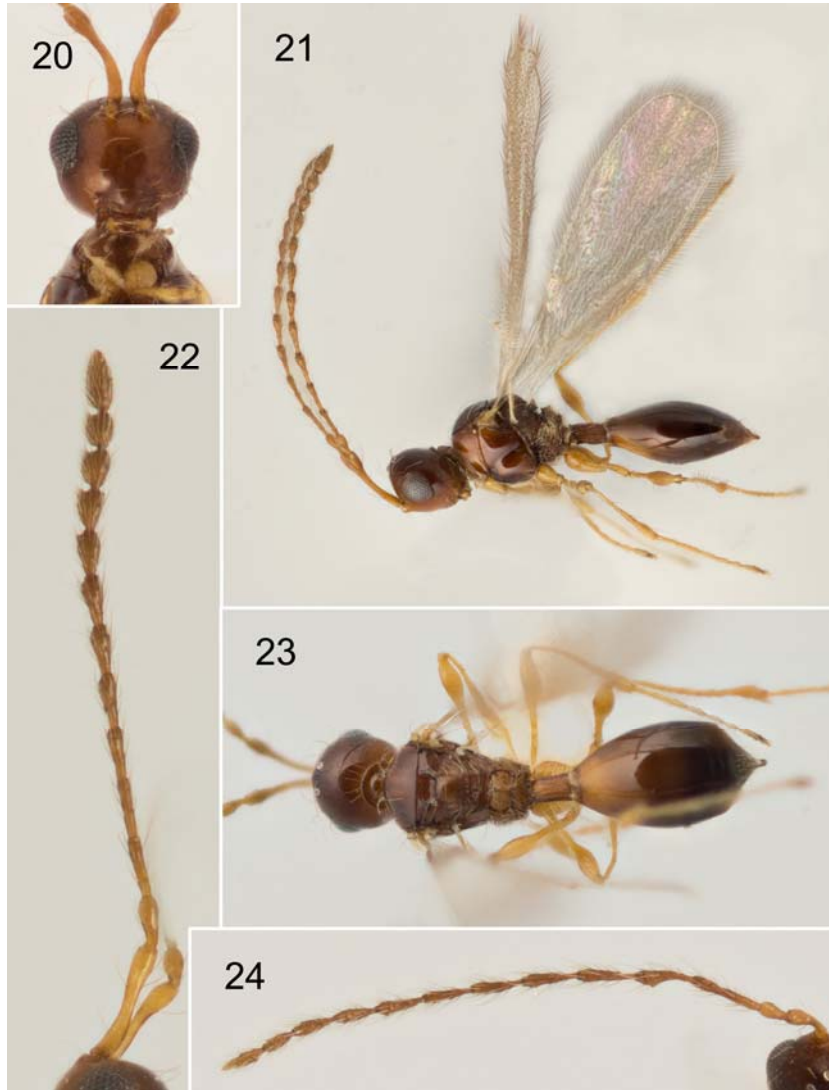
Figs 20–24. Entomacis leptocera sp. n. (20–23 – ♀; 24 – ♂); 20 – face; 21 – body, lateral view; 22 – antenna, lateral view; 23 – body, dorsal view; 24 – antenna, dorsal view.

Antennomeres without tiloids covered with scattered long setae. Scape broadened apically, narrow medially, curved and smooth, with few setae. A13 convex on ventral side, A11–A13 with MGS brush. Connection between clavomeres A9–A13 in lateral view situated dorsally of median line (Fig. 22). Ratios of length to width of antennomeres in dorsal view: 25:3.5; 8:3; 13:2; 11:2; 11:2.5; 10:3; 9:3; 9:3; 8:3; 7:3; 7:3; 7:3.5; 10:3.5.