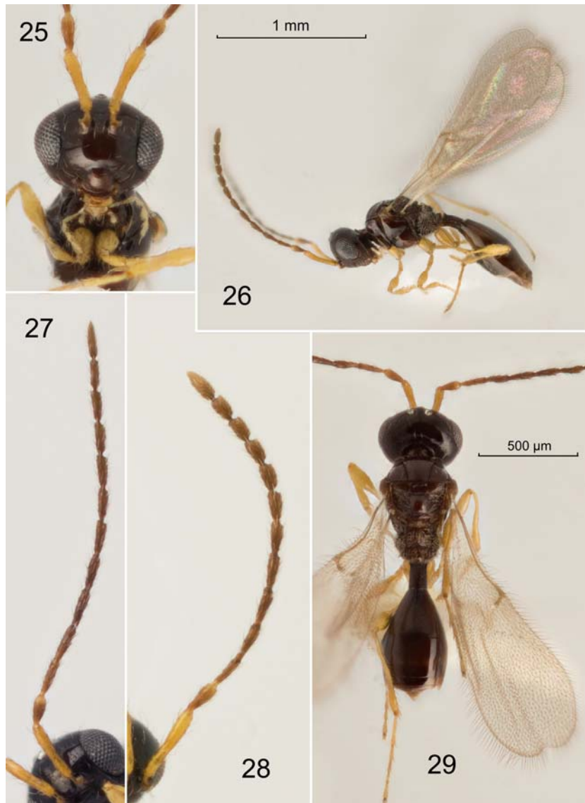
Figs 25–29. Entomacis laticeps sp. n. (25–26, 28–29 – ♀; 27 – ♂); 25 – face; 26 – body, lateral view; 27, 28 – antenna, lateral view; 29 – body, dorsal view.

Colour. Body bark brown; palpi, legs, venation, mandible and A1 yellowish brown; tegula and A3–A13 pale brown.