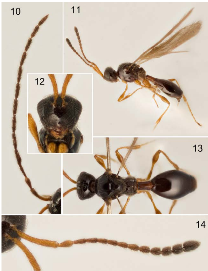
Figs 10–14. Entomacis leptos sp. n. (10 – ♂, 11–14 – ♀); 10, 14 – antenna, lateral view; 11 – body, lateral view; 12 – face, frontal view; 13 – body, dorsal view.

DESCRIPTION. Holotype. Female. Body length 1.6 mm; fore wing length 1.6 mm; antenna length 1.1 mm.