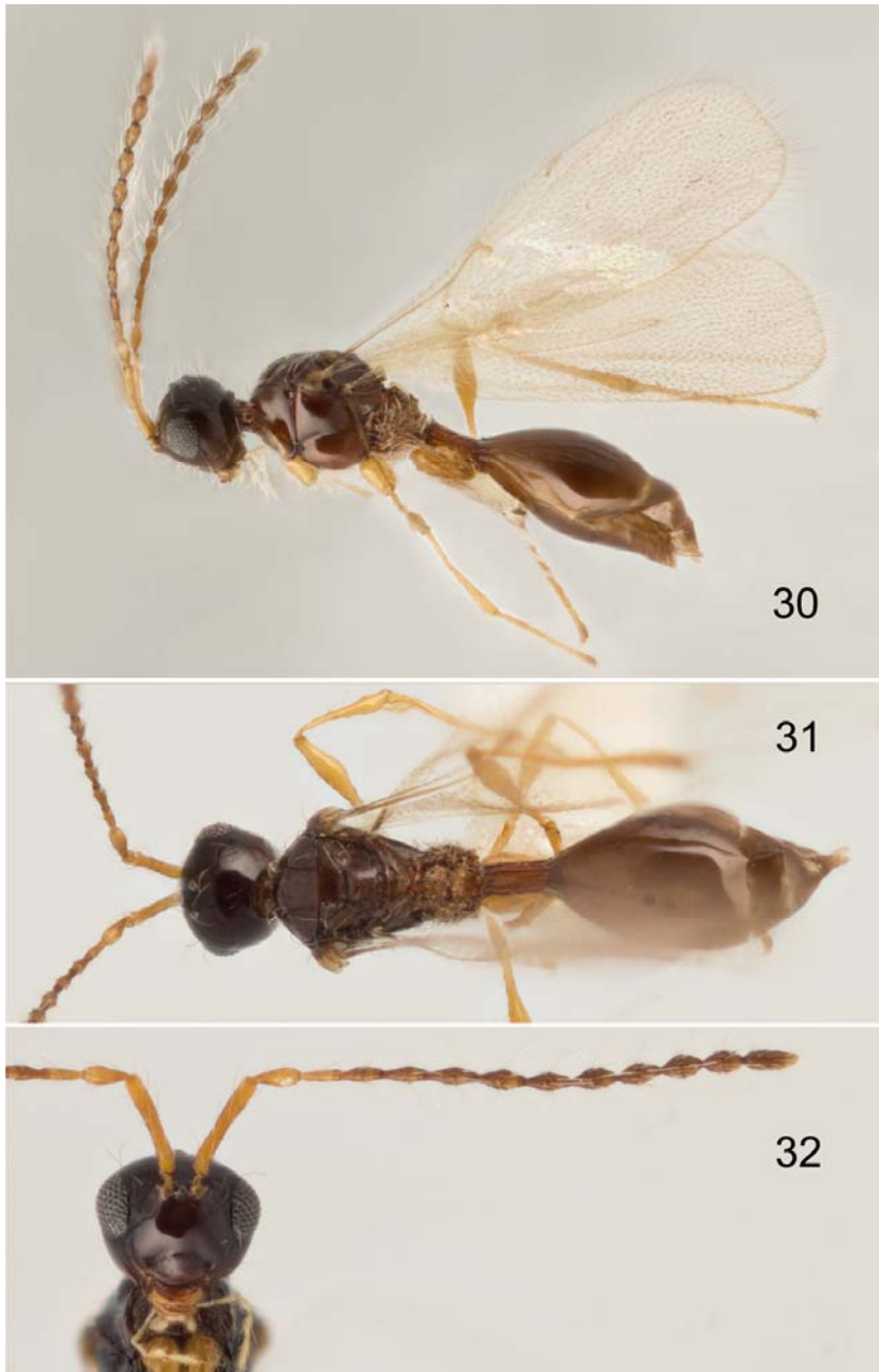
Figs 30–32. Entomacis canonica sp. n. (♂). 30 – body, lateral view; 31 – body, dorsal view; 32 – face and antennae.