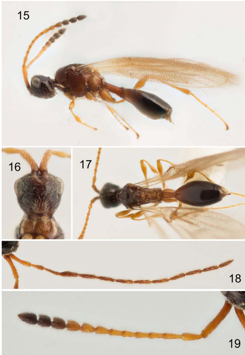
Figs 15–19. Entomacis alticeps sp. n. (15–17, 19 – ♀, 18 – ♂); 15 – body, lateral view; 16 – face, frontal view; 17 – body, dorsal view; 18, 19 – antenna, lateral views.