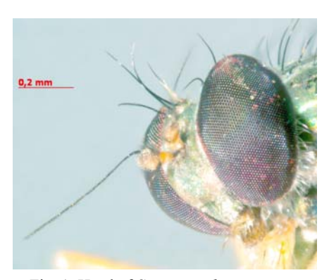
Fig. 1. Head of Sciapus richterae sp. n., fronto-lateral aspect.

setae at base and at apex. Fore femur with antero- and posteroventral rows of long white hairs, longer than femur height; fore tibia and tarsi devoid of setae; 5th segment of fore tarsus ovate, flattened dorsoventraly. Mid femur with row of short black anteroventral setae, not longer than femur height, and with long fine white ventral cilia, twice longer than femur height;