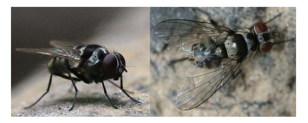
Fig.1. Limnophora ponti sp. n., male and female.