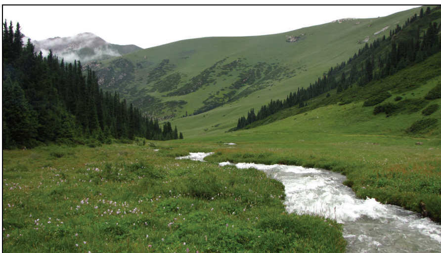
Fig. 6. The valley of Buzunbai River, Terskey-Ala-Too Ridge, Kazakhstan – the type locality of Dolichopus dubrovskiyi sp. n.