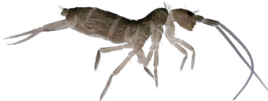
Fig. 1. Appearance of Pogonognathellus littoralis Kuprin et Potapov, sp. n.

OTHER MATERIAL. Russia: Primorskii krai, Vladivostok, Russkii Island, Malyi Dzhigit Bay, stony littoral, floatation, 26.VIII 2018, 10 juv. (in alcohol), coll. A. Kuprin & Yu. Shveenkov (FCBV); Vladivostok, De-Fries Peninsula, Uglovoy Bay, stony littoral, floatation, 04.VI 2019, 2 specimens (in alcohol), coll. A. Kuprin (FCBV); Fokino, Rudneva Bay, littoral (sand/algae), floatation, 07.VII 2018, 5 specimens (in alcohol), coll. A. Kuprin (FCBV).